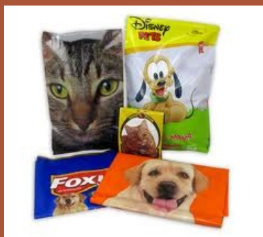
Pet Food Packaging

Pioneers in the industry, we offer Food Packaging Material such as Pet Food Packaging, Dairy Products Packaging, Bulk Packaging, Flour Packaging, Spices Packaging, Tea & Coffee Packaging and many more items from India.