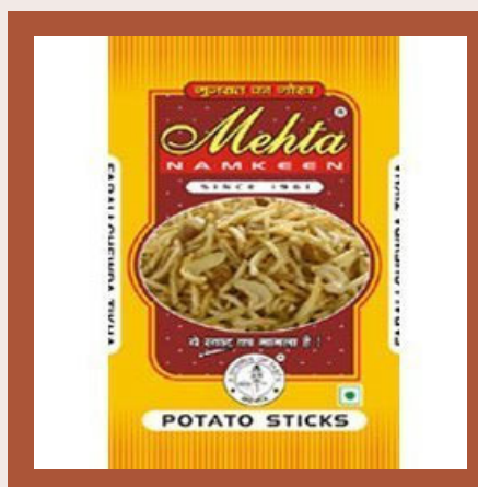
Laminated Pouch For Namkeen & Wafers