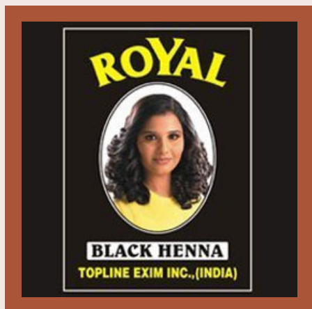
Aluminum Foil Pouch For Henna