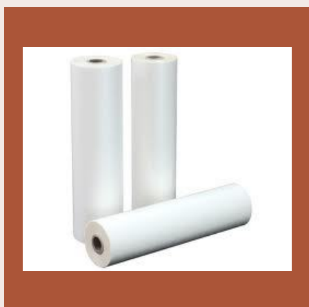
Flexible Laminating Film Rolls