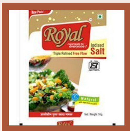
Laminated Pouch For Salt

Manufacturer & Trader of a wide range of products which include Laminated Packaging Pouches such as Laminated Pouch For Salt, Laminated Pouch For Detergents And Soaps, Laminated Pouch For Cement, Laminated Pouch For Spices, Laminated Pouch For Seeds, Laminated Pouch For Biscuits and many more items.