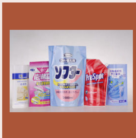
Laminated Pouch For Oil, Shampoo