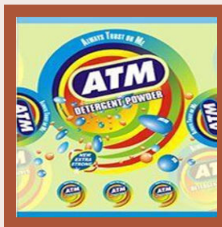
Laminated Pouch For Detergents And Soaps