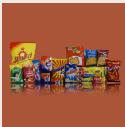
Laminated Poly Pack Pouches