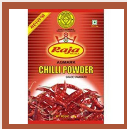
Laminated Pouch For Spices