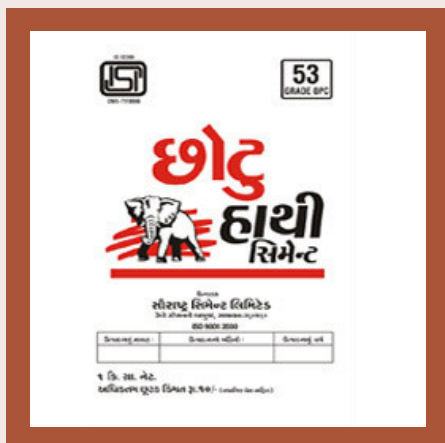
Laminated Pouch For Cement