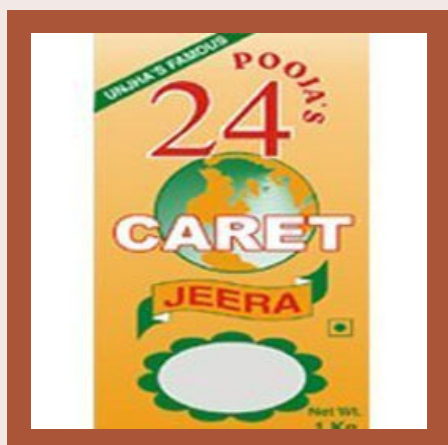
Laminated Pouch For General Grocery Items