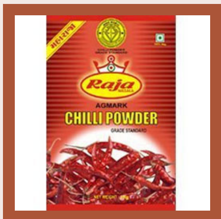
Laminated Pouch Bags