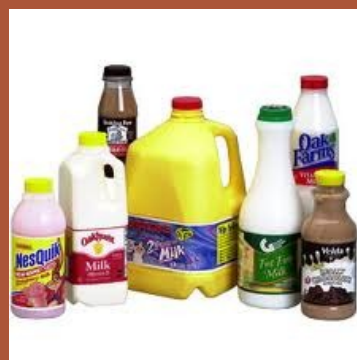
Dairy Products Packaging